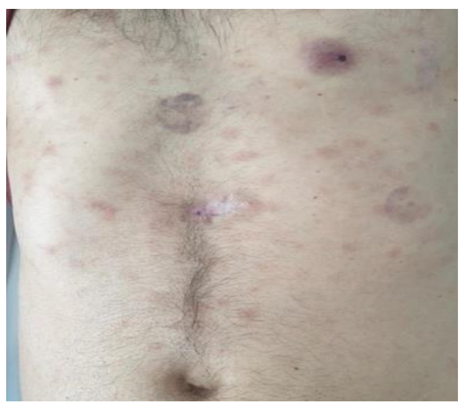
Figure 1. Skin involvement of blastic plasmacytoid dendritic cell neoplasm

A 38-year-old man was admitted to our clinic with left elbow mass without other skin involvement. Bone marrow aspiration revealed CD4<sup>+</sup> and CD123<sup>+</sup> positive blast cells and biopsy revealed CD56- and TdT-positive BPDCN with 80% Ki-67 proliferation index. PET-CT staging was consistent with stage IV disease. Complete blood count was normal during his first admission, but the patient had pancytopenia, spontaneous disseminated intravascular coagulation, and tumor lysis before pathology results were obtained. Serology results for hepatitis B, hepatitis C, and HIV were normal. The hyper-CVAD regimen was initiated with aggressive tumor lysis and coagulopathy management. After one cycle of Hyper-CVAD and high-dose methotrexate/cytarabine; the patient achieved CR. chemoprophylaxis Intrathecal was then administered. Allogeneic SCT was planned because of the leukemic clinical presentation, but the patient had no human-leukocyte antigen (HLA)-matched sibling donors. The patient received high dose BEAM as a preparative regimen for autologous SCT. After transplantation the patient has been in CR for three years.