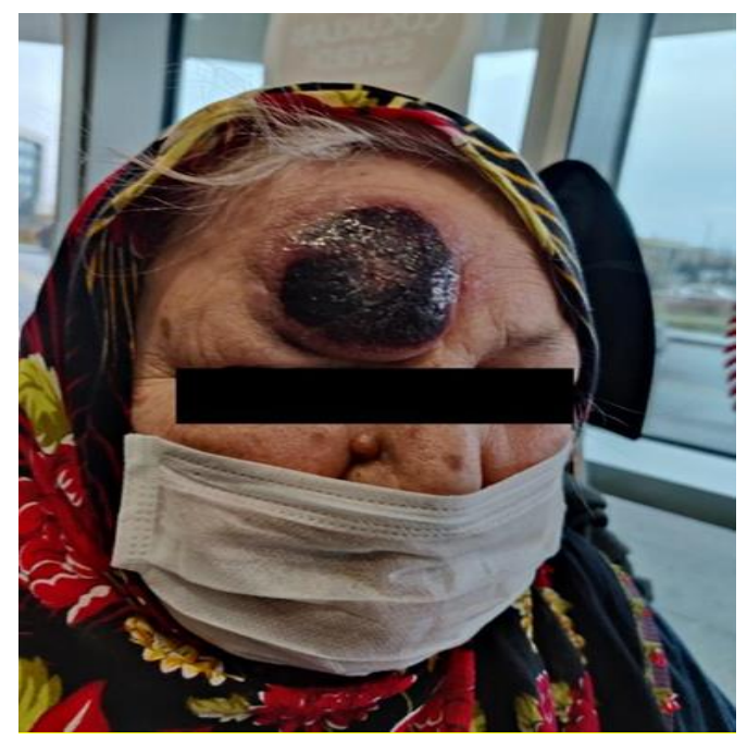
Figure 2. Frontal mass due to blastic plasmacytoid dendritic cell neoplasm

A 78-year-old female patient presented with a history of atrial fibrillation, hypertension, and congestive heart failure. The patient had been diagnosed with International Staging System stage II kappa light-chain multiple myeloma 17 years before. No extramedullary involvement was observed. Vincristine, adriamycin, and dexamethasone were administered for four cycles before consolidation with high-dose melphalan (200 mg/m<sup>2</sup>) and autologous SCT. CR was achieved within two years. Thalidomide (100 mg/day) treatment was administered for twelve years due to biochemical relapse. During follow-up, a 6 cm diameter purple mass was noticed in the frontal region (Figure 2).