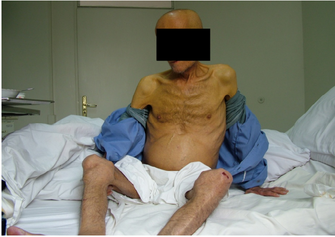
Figure- 1. The patient on admission.