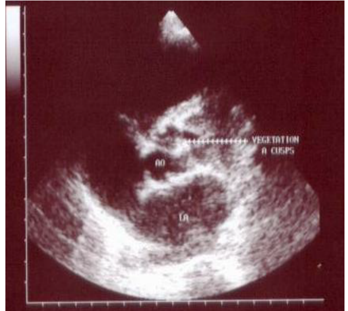
Figure- 4. Patient's echocardiography.

patient's symptoms were progressing. On admission patient was complaining abdominal pain and diarrhea and his physical examination on abdomen showed an enlarged liver, ascites and evidence of splenectomy (Figures- 1, 2). Laboratory findings were as follows: hemoglobin 11.5 g/dl; hematocrit 36%; platelet count 100 \times 10^9/L , and