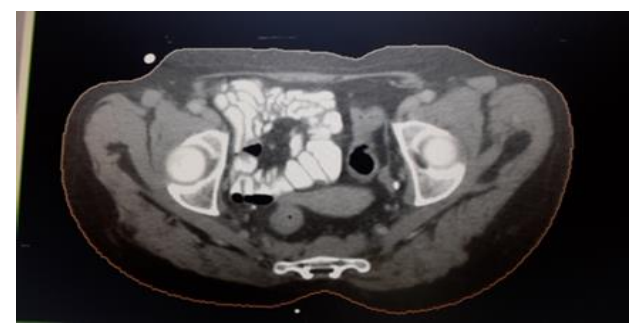
Figure 2: CT scan showing presacral mass