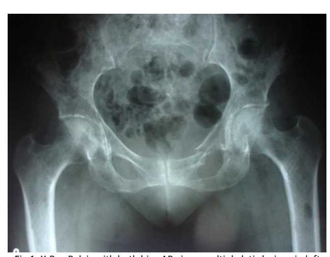
Fig 1. X-Ray Pelvis with both hips AP view- multiple lytic lesions in left subtrochanteric region.

X-Ray Skull Lateral view: showed multiple variable sized, ill-defined lytic areas involving the calvarium. X-Ray Pelvis with both hips AP view: showed multiple lytic lesions in left subtrochanteric region (Figure 1).