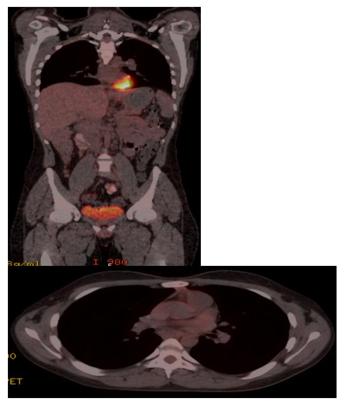
Figure 4: PET/CT showed bilateral a few 1 to 2 cm diameter cervical lymphadenopathies without FDG uptake. It was interpreted as complete metabolic remission.

The patient was diagnosed with Tafro syndrome. We chose R-CHOP regimen for the treatment because of the absence of the anti-IL-6 therapies in our country and good steroid response which was experienced during follow-up. This regimen was repeated 2 more times at 21-day intervals. Grade 1cytopenias which did not necessitate hospitalization occurred. The patient had a good response to this therapy, and his clinical, laboratory and radiologic findings were improved. After 1 year of diagnosis, the patient underwent physical examination, laboratory and radiological investigations. The patient was in complete remission in all parameters including metabolic remission on PET/CT (Figure 4). However, the patient underwent three more cycles of R-CHOP regimen.