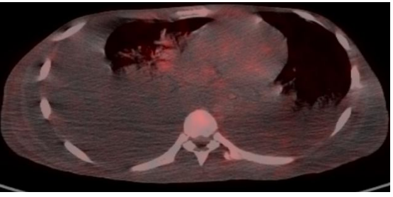
Figure 2: Multiple lymphadenopathies in cervical, axillary, mediastinal, paraaortic, mesenteric and inguinal lymph nodes. FDG uptake rates were from 3.6 to 8.5.

A bone marrow aspiration was performed, and it hypocellular showed marrow with absence of megakaryocytes. Maturation of the myeloid cells was complete, and blasts rate were <%1. Due to the absence of atypical cells in bone marrow aspiration, we didn't perform bone marrow biopsy. Left axillary lymph node dissection was performed. Postoperative microscopical examination showed atretic germinal centers and expanded interfollicular areas containing sheets of plasma cells. LANA-1 staining for HHV-8 was negative (Figure 3).